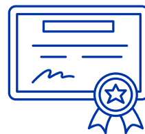
Certification Ready Program